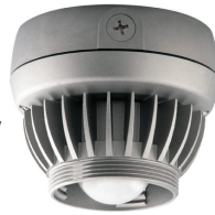
VXLED 13W & 26W

RAB Lighting is committed to creating high-quality, affordable, well-designed and energy-efficient LED lighting and controls that make it easy for electricians to install and end users to save energy. We'd love to hear your comments. Please call the Marketing Department at 888-RAB-1000 or email: marketing@rablighting.com