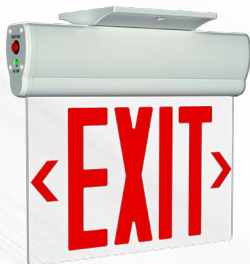
Ceiling or Wall

The ELX eliminates the guesswork from exit sign installation. With comprehensive mounting hardware included in every box, you can tackle wall, ceiling, recessed, or sloped ceiling applications. And with field-selectable red/green colors included as well, the ELX reduces inventory needs while ensuring you always have the right exit sign for any project.