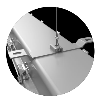
Aircraft cable for pendant mount (59" cable length)