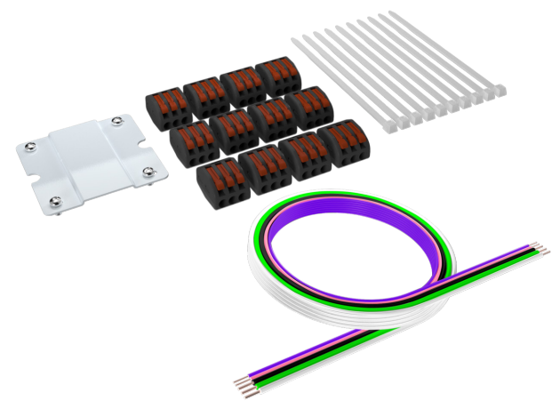
Daisy Chain Mount Kit: SR JOIN KIT-G2

Continuous-run mounting is a breeze with the joiner bracket accessory.