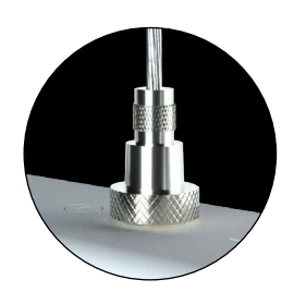
Suspended Mount Two 120" cables included