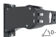
Adjustable Universal Pole Mount