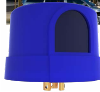
Twistlock Photocell R-3P-PCT (120-277V) RPCT-480 (480V)