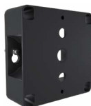
Wall Mount A17-WM