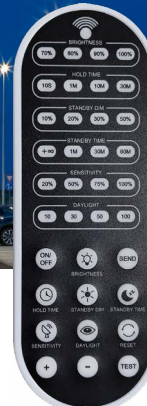
Remote for Microwave Sensor* A17-REMOTE