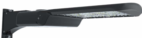
Comes standard with Universal Pole Mount

With several mounting options available, the A17 can be used throughout various areas for one unified look: parking lots, building façades, adjacent walkways, etc.