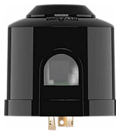
Lightcloud Twistlock Photocell LCTWIST/K

* Remote control required for managing settings of the microwave sensor (A17 with MVS sensor only).