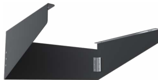
A17-RHS1 (up to 150W)