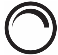
Dimmable 0-10V, down to 5%