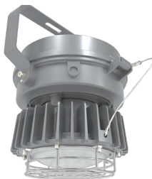
Surface and Pendant Mount (Remove yoke for pendant mount)

The HAZLED is available with four mounting options for use throughout an entire site: