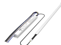
Battery Backup: RLB-EM