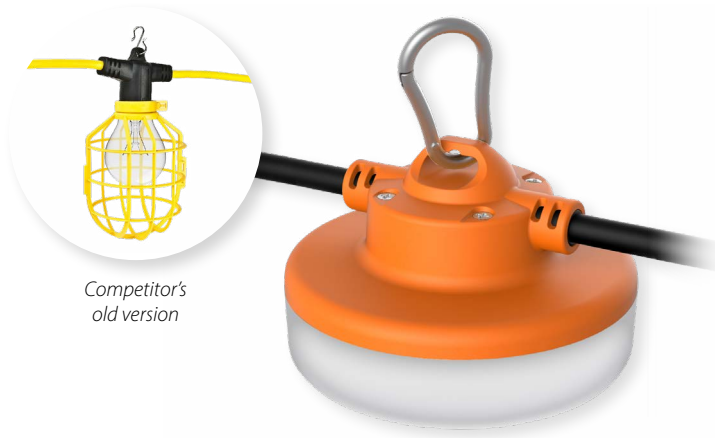
Competitor's old version

RAB's warranty is subject to all terms and conditions found at rablighting.com/warranty