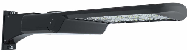
Comes standard with Universal Pole Mount