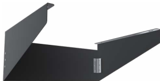
A17-RHS1 (up to 150W)