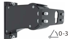
Adjustable Universal Pole Mount A17-ADJ-KIT