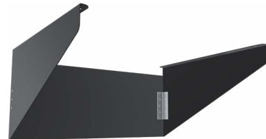
A17-RHS2 (200W and up)