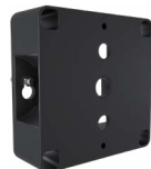
Wall Mount A17-WM