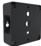
Wall Mount A17-WM