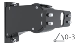
Adjustable Universal Pole Mount A17-ADJ-KIT