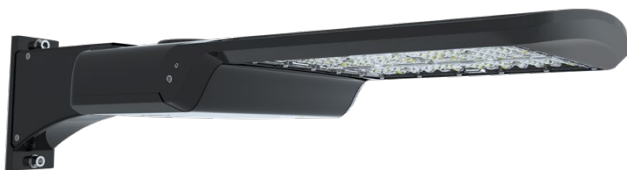
Comes standard with Universal Pole Mount