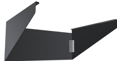
A17-RHS2 (200W and up)