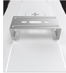
Surface mount (standard)