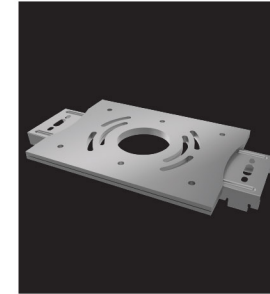
Junction box mounting bracket