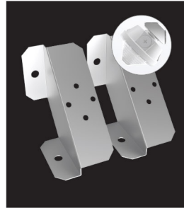
45° Angle, surface-mount bracket