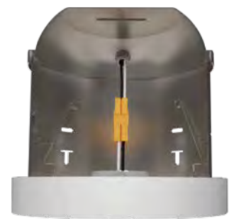
Optional Mounting Kit SM34-5IN-RETROFIT SM34-7IN-RETROFIT